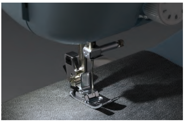
LED lighting for easy viewing