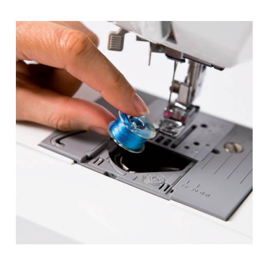
Quick-set bobbin – just drop in a full bobbin and you are ready to sew