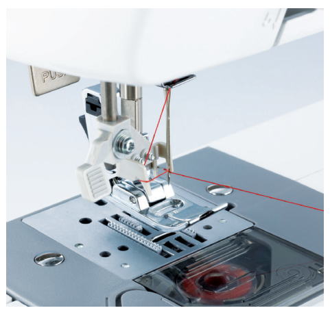
Easy automatic needle threading